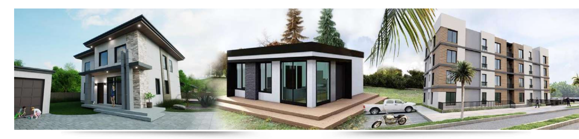
The Leader in Affordable Housing.